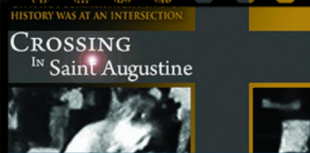
Crossing In St. Augustine Andrew Young

Special Guest: Ambassador Andrew Young 6:00PM