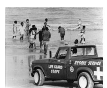
Vintage Photo of Beach Wade-In, 1964

Ticket sales are going great. We anticipate a full house for our 5<sup>th</sup> Annual ACCORD Freedom Trail Luncheon presented by the Northrop Grumman Corporation, "Honoring true American Heroes of the Civil Rights Movement of St. Augustine" and Commemorating the 47<sup>th</sup> Anniversary of the Signing of the Landmark Civil Rights Act of 1964.